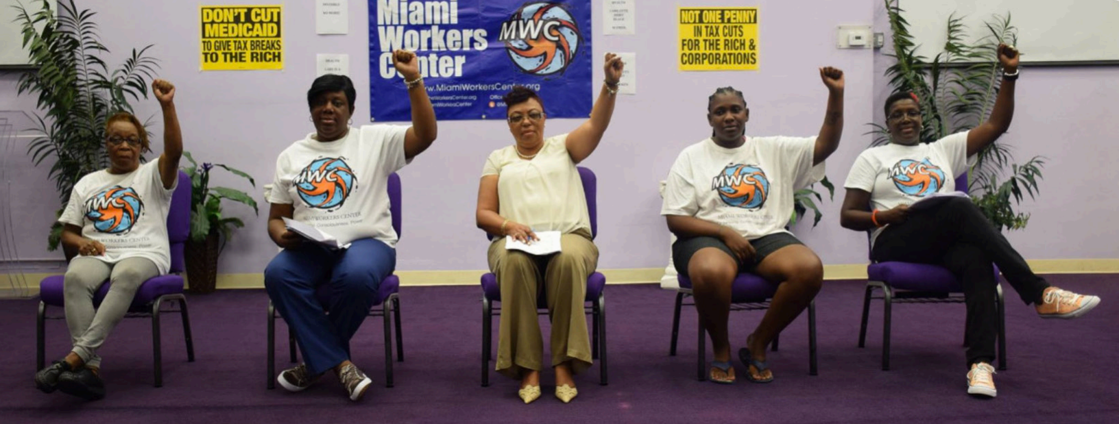
Miami Workers Center