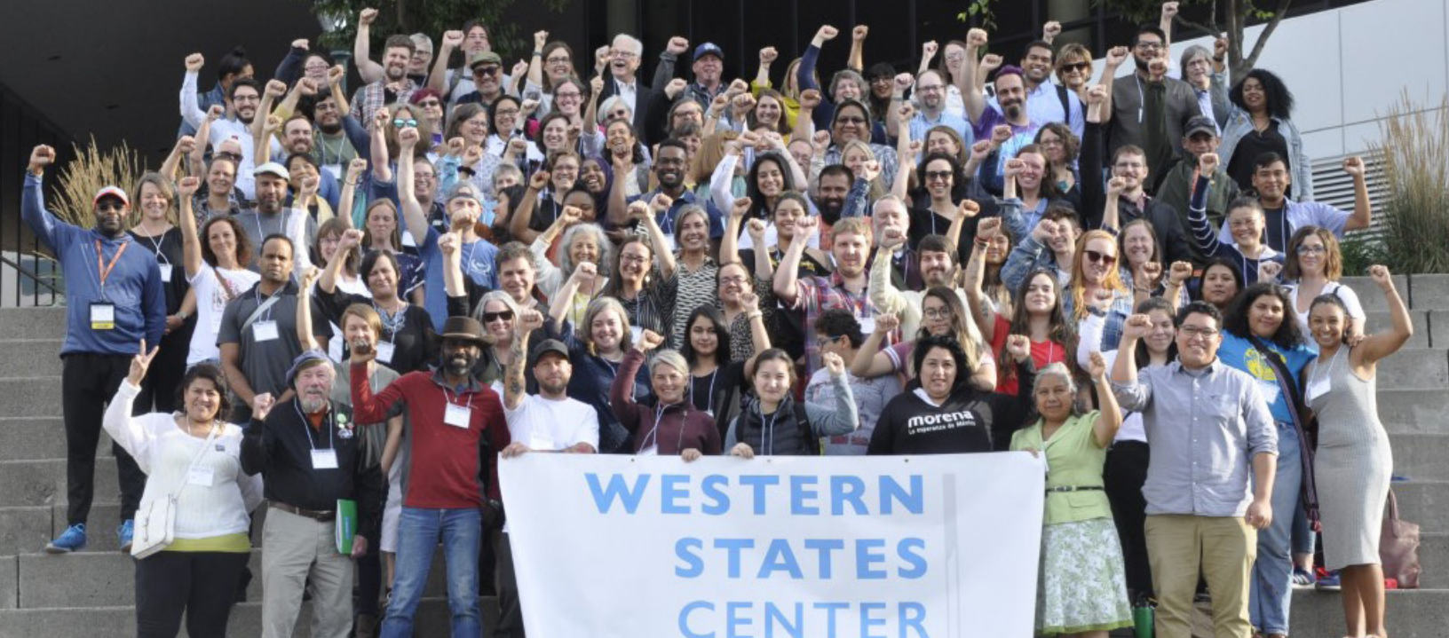
Western States Center

landmark 2017 bill that ensured access to the full range of reproductive health services for all Oregonians. In addition to its leadership development and advocacy work, Western States continues to bring national-level thought leadership around the intersections between white supremacy, misogyny, and anti-Semitism.