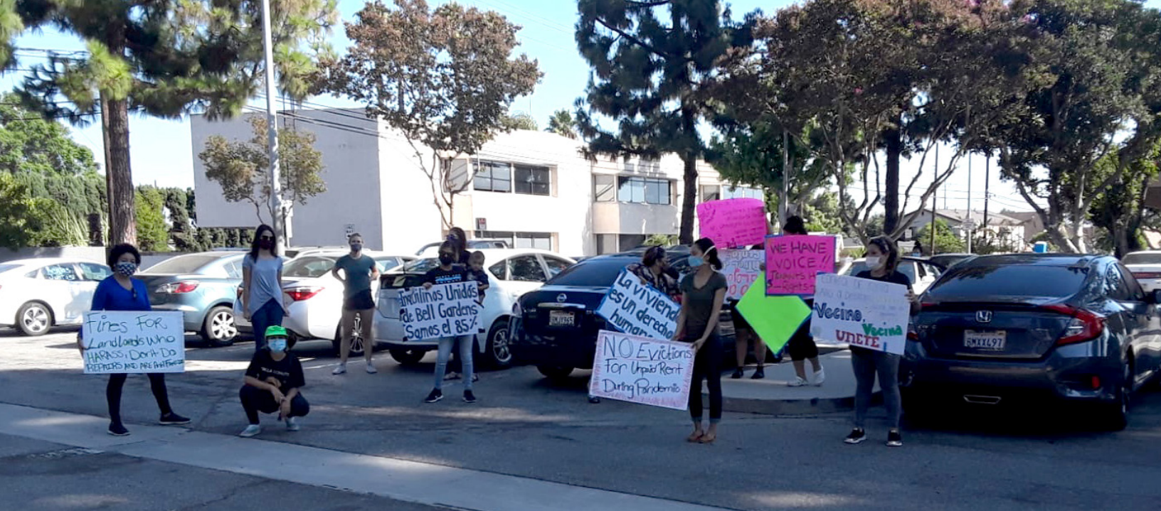
California Latinas for Reproductive Justice