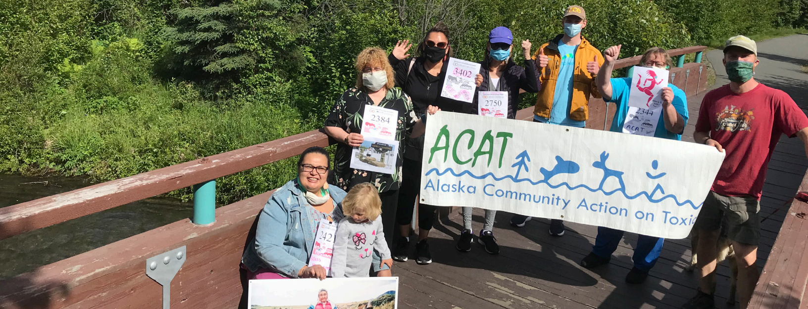
Alaska Community Action on Toxics (ACAT)