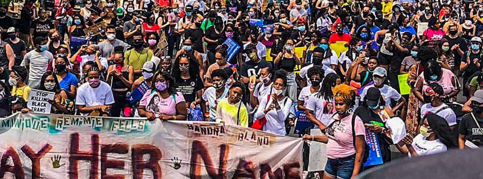
New Voices for Reproductive Justice