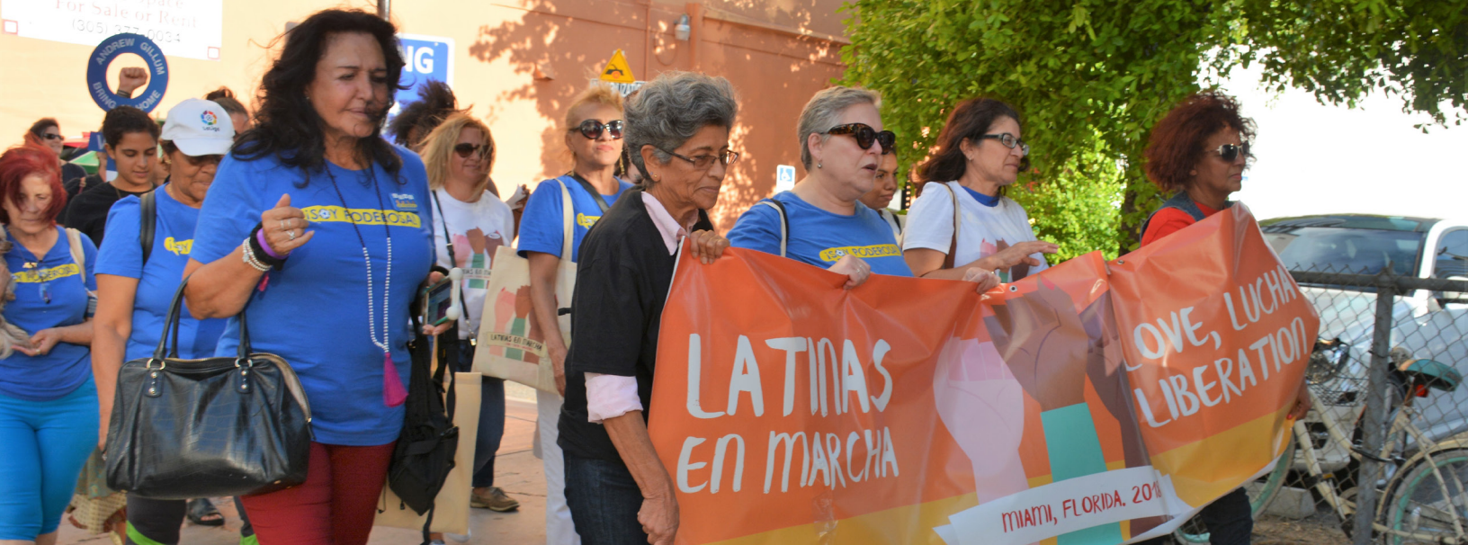
New Florida Majority