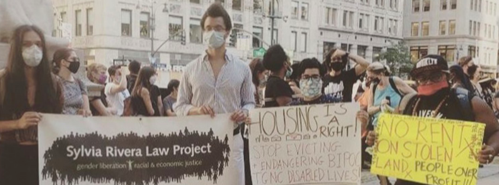
Sylvia Rivera Law Project