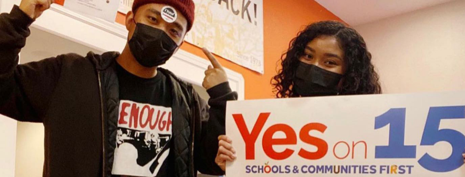
ACT for Women and Girls