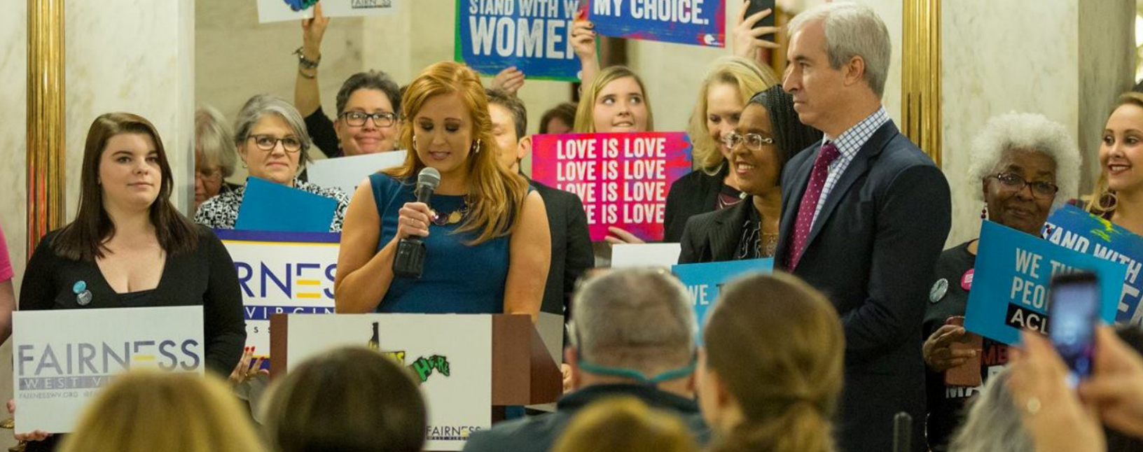
West Virginia Free

counter emergency contraception, and fully implement a child sexual abuse policy that has been in place since 2010.