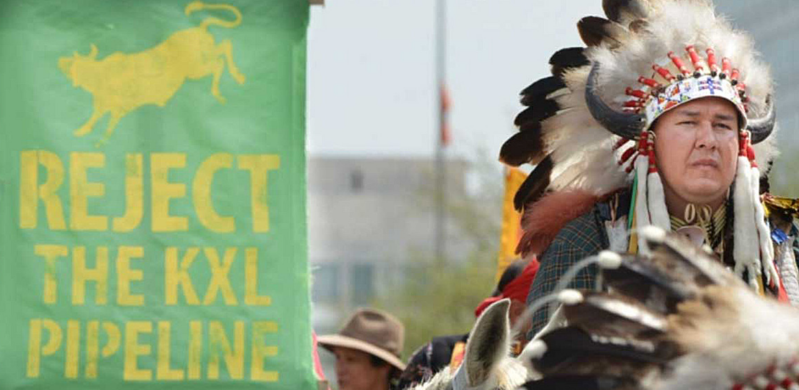
International Indian Treaty Council