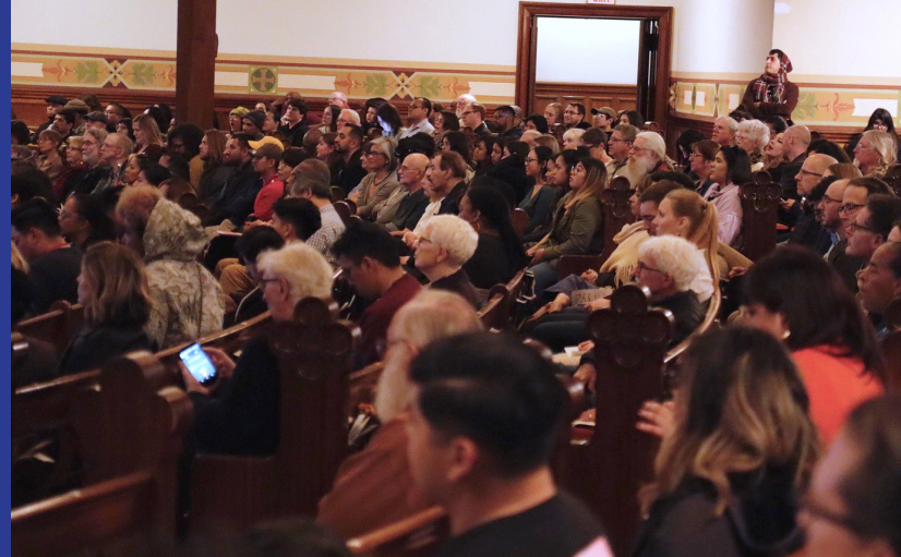
Khmer Girls in Action