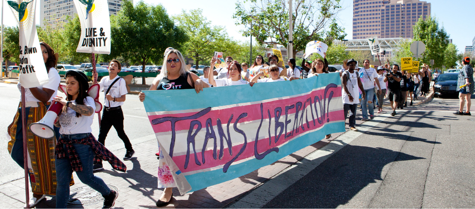
Transgender Law Center