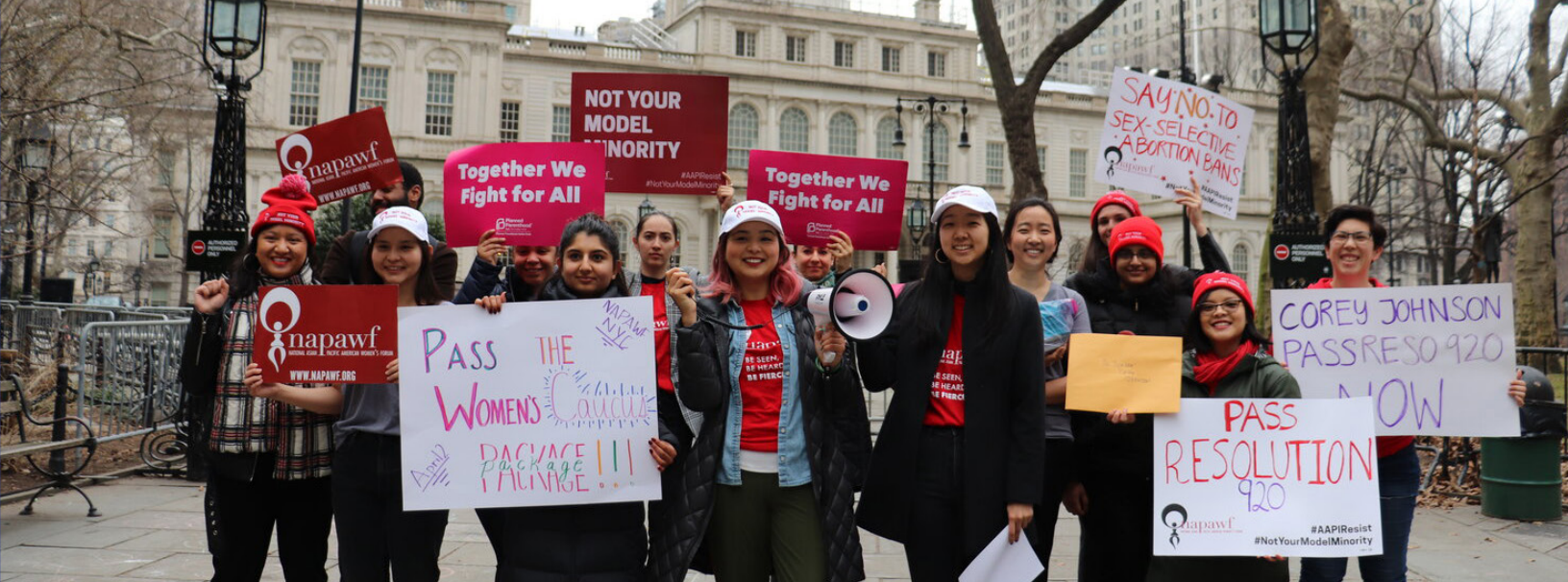
National Asian Pacific American Women's Forum