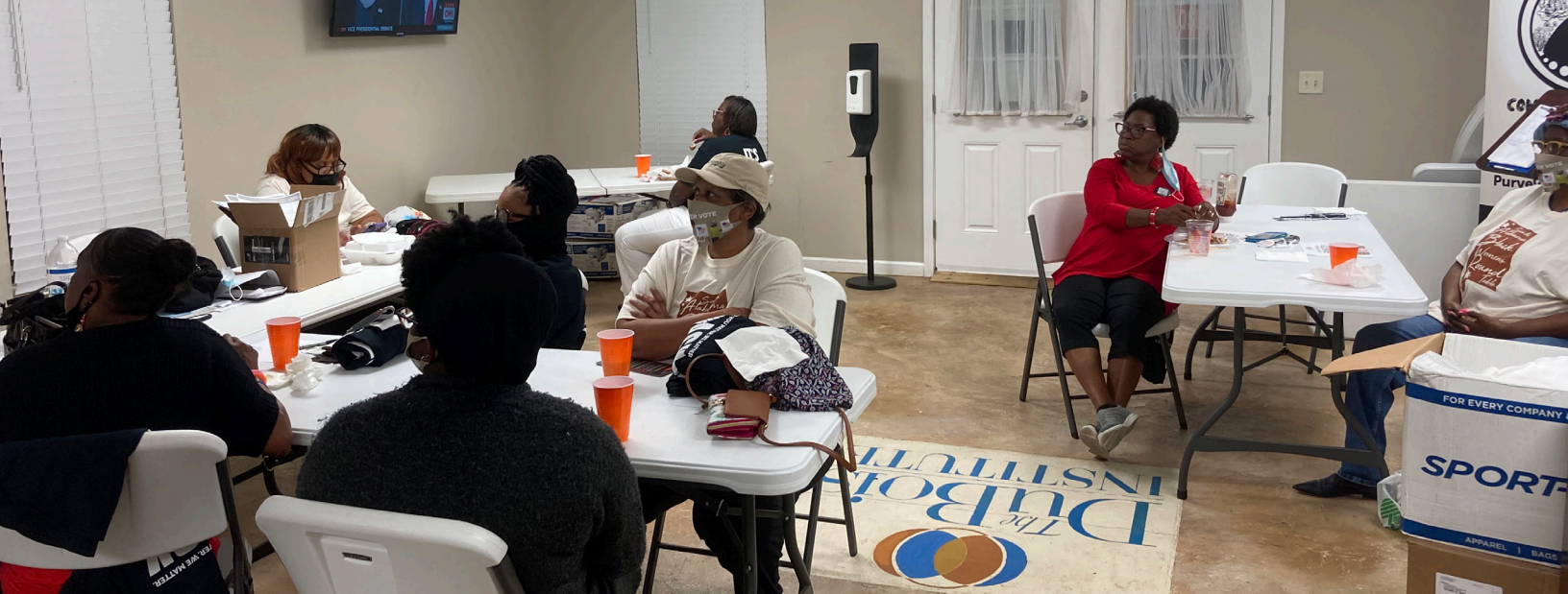
South Alabama Black Women's Roundtable

often ignored in traditional election outreach. URGE spoke with over 16,000 young voters in GA, OH, and AL, helping them make a plan to vote by sharing resources to help navigate voter suppression and COVID-19 safety concerns. During the pandemic, URGE continued to organize young people around its priorities of abortion access (helping to create the first-ever reproductive health, rights and justice statewide coalition in Alabama), sex work decriminalization and municipal-level abortion access campaigns in TX, and economic justice for young people whose lives have been devastated by pandemic-related shutdowns.