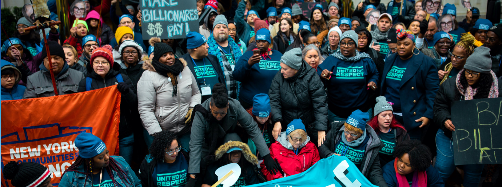
United for Respect

companies to increase hourly wages by $5; provide paid leave; guarantee protection so that workers can speak out about workplace policies that threaten their wellbeing and reproductive health; and include workers' voices in shaping the pandemic policies that affect their jobs and lives.