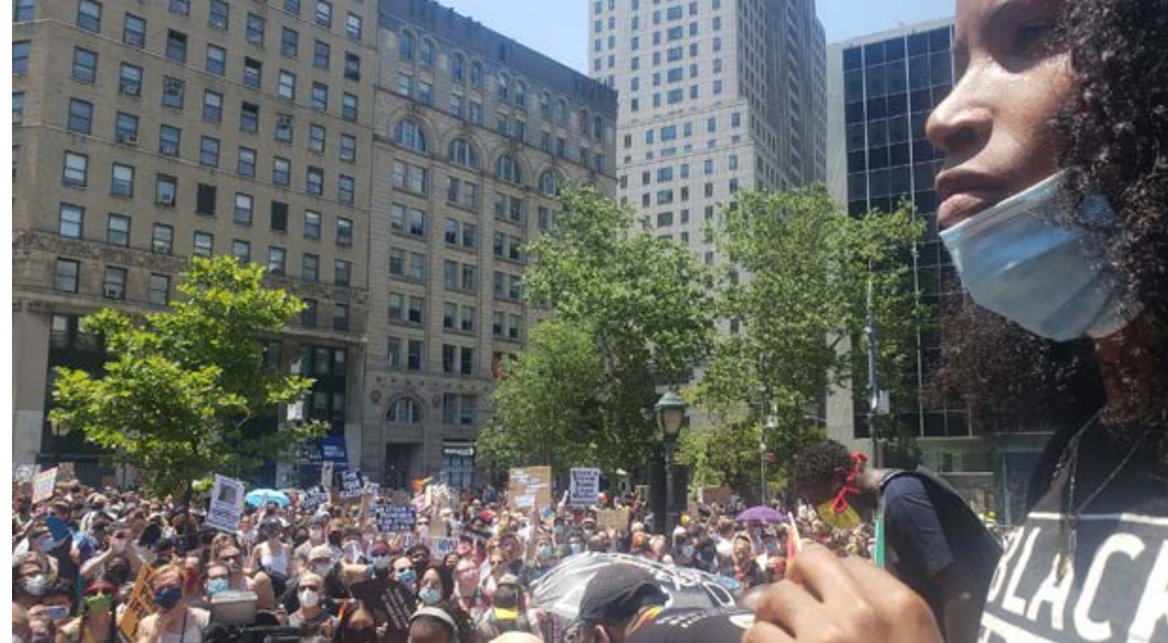
Black Trans Media at Queer Liberation March for Black Lives

San Francisco’s Tenderloin neighborhood has long been the heart of the Bay Area’s LGBTQ+ community; the 1966 uprising at the Compton Cafeteria, located in the heart of the Tenderloin, is the first documented uprising of