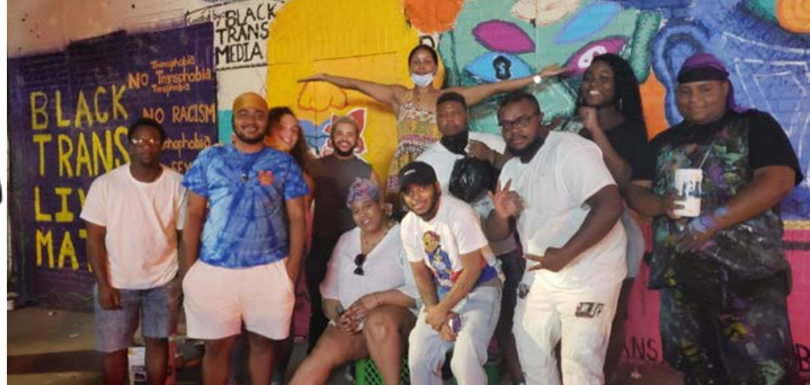
Black Trans Media