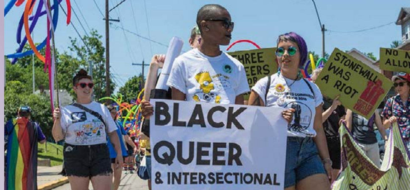
Black Queer & Intersectional Collective

Black Trans Femmes in the Arts Black Trans Media The Black Trans Prayer Book SisTers PGH Transgender Advocates, Knowledgeable, Empowering (TAKE) Resource Center